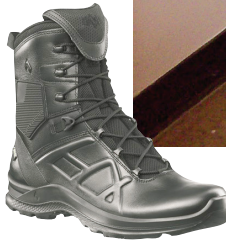
Black Eagle Tactical 2.0 GTX High