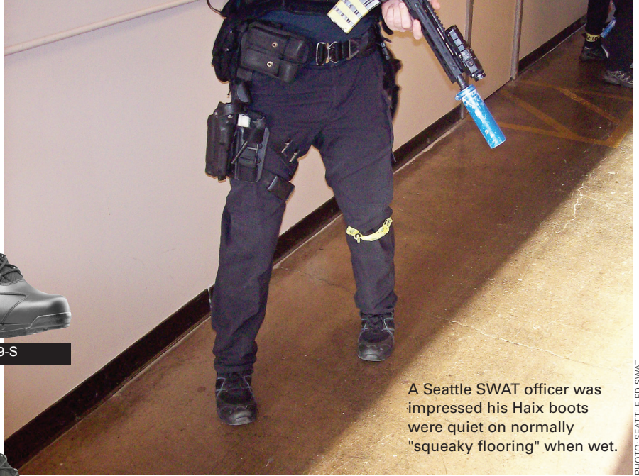
A Seattle SWAT officer was impressed his Haix boots were quiet on normally "squeaky flooring" when wet.

For more information about the full range of Haix footwear, visit www.haix.com .