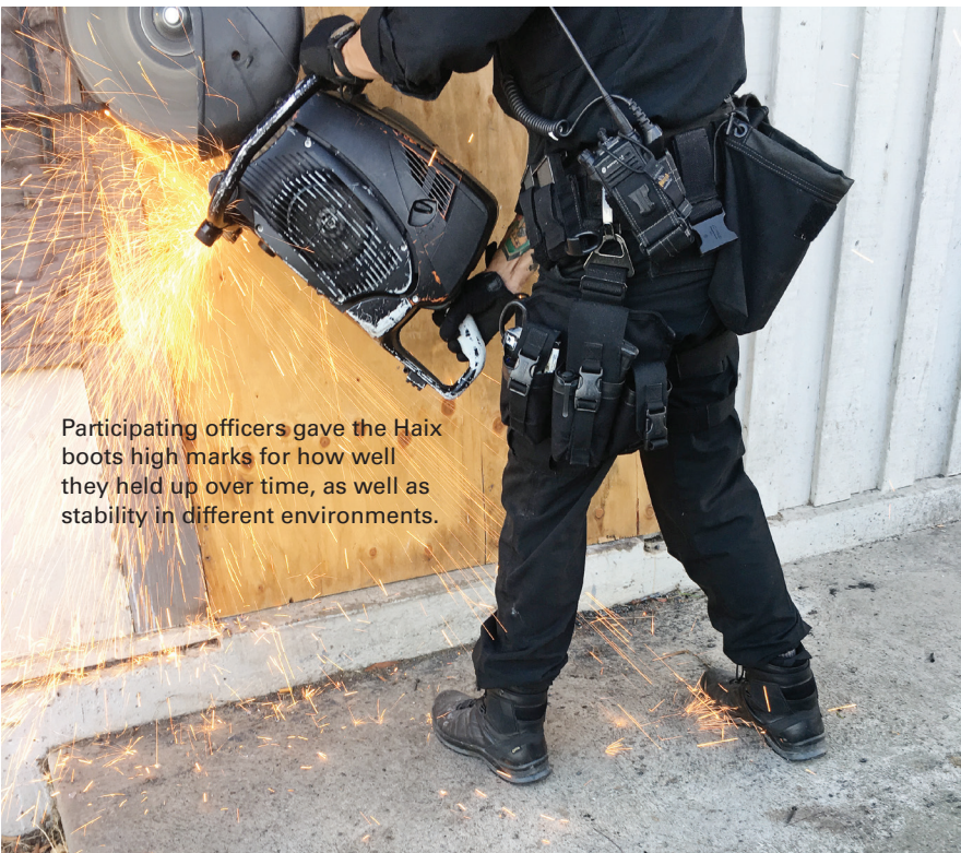
Participating officers gave the Haix boots high marks for how well they held up over time, as well as stability in different environments.